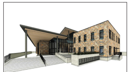
Artist rendering of the new Downtown Connection Center.