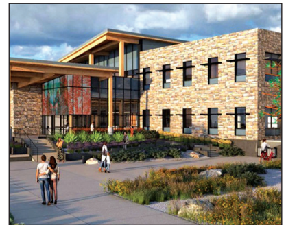
Artist rendering of the new Downtown Connection Center.