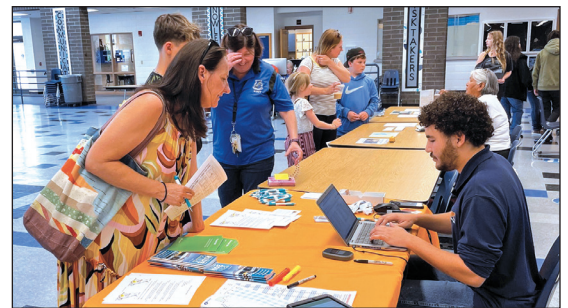
The Mountain Line team assists FUSD students.