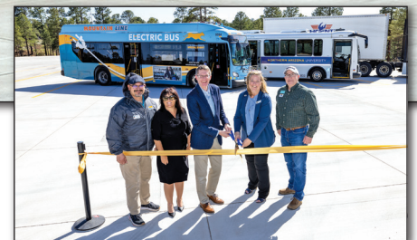
The CDL Training and Testing Course opened May 2024.